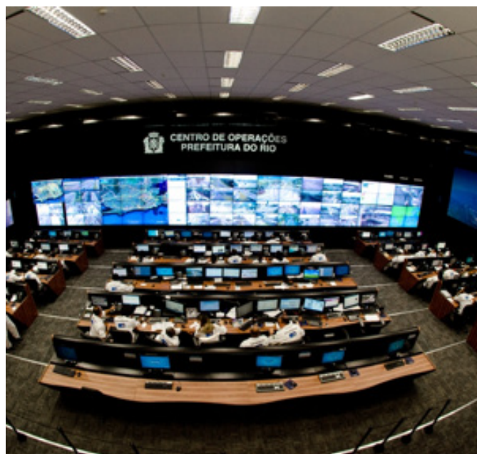
Figure 3: Rio de Janeiro’s Operations Centre