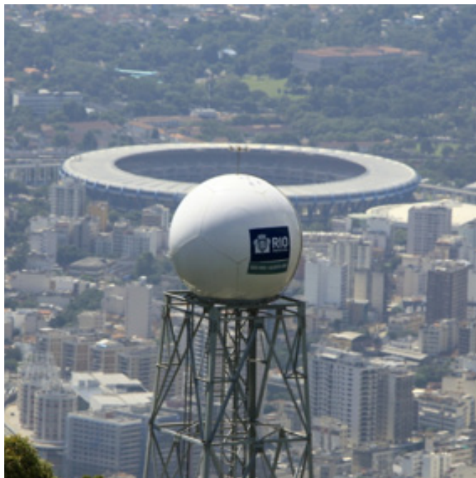
Figure 4: Meteorological Radar in the City of Rio de Janeiro